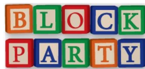
Purdue Extension's Block Party Kick-Off