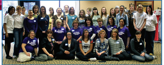
The FWMSA's 12th Annual Cinderella Dress Day

On Cinderella Dress Day, a staff of 50 volunteers, including Alliance members, CHAT homeschool students, Tower Bank employees, Family Practice Residents, and local church members, tended to every girl's dream.