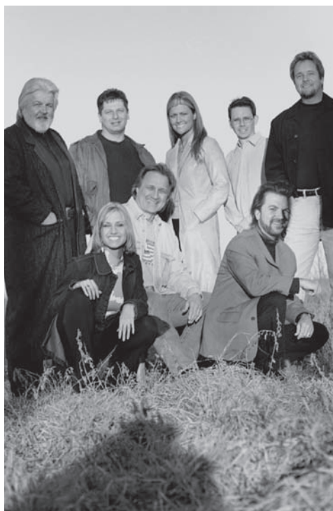
the Wright Brothers